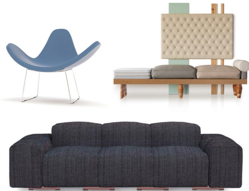
Image of the product fully framed and white background