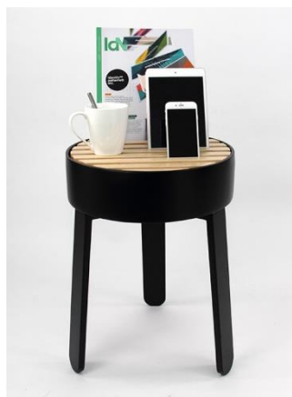
Immagine dell'oggetto inquadrato interamente ma fondo grigio